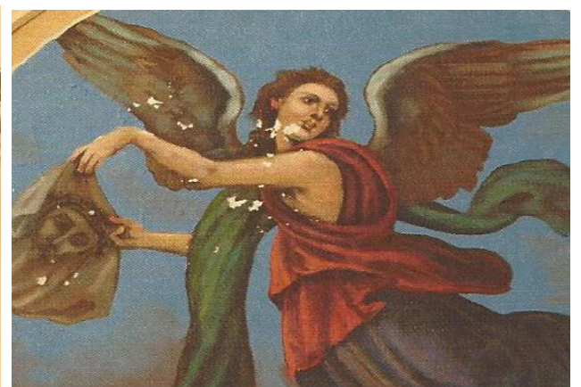
Paint Flaking on a Number of Frescoes