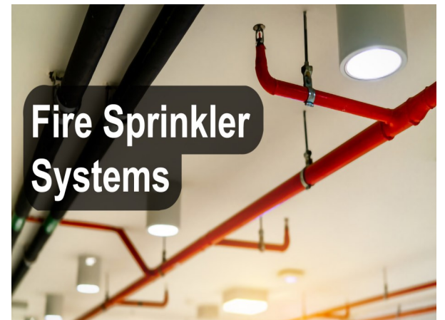
Fire Sprinkler in Community Building