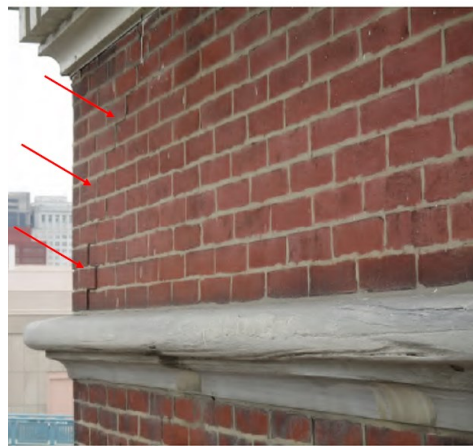
Cracking & repointing of brickwork