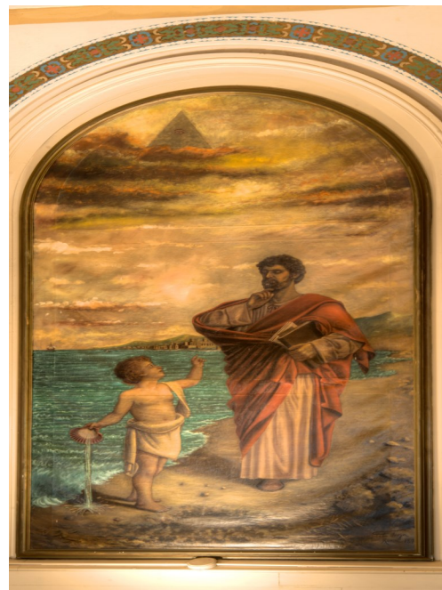
Artwork restoration (Eight St. Augustine Lunettes)