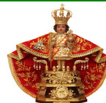
National Shrine of Santo Niño de Cebú

24 th Sunday in Ordinary Time – September 13, 2020