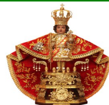
National Shrine of Santo Niño de Cebú

23 rd Sunday in Ordinary Time – September 06, 2020