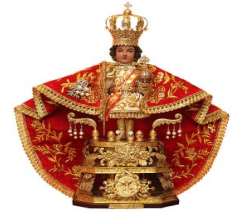
National Shrine of Santo Niño de Cebú

22 nd Sunday in Ordinary Time ♦ September 1, 2019