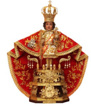
National Shrine of Santo Niño de Cebu

28 th Sunday in Ordinary Time October 10, 2021