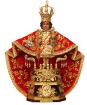
National Shrine of Santo Niño de Cebú

Served by the Augustinian Friars since 1796