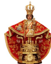
National Shrine of Santo Niño de Cebu

Served by the Augustinian Friars since 1796