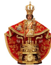
National Shrine of Santo Niño de Cebu

Served by the Augustinian Friars since 1796