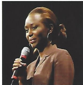
Immaculée Ilibagiza Renown speaker and author of Left to Tell surviving the Rwandan genocide