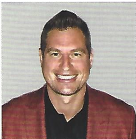
Brent Celek Philadelphia Eagles celebrated tight end and Superbowl LII champion

Man Up Philly 2020 invites the men of the Archdiocese of Philadelphia to the 12 th Annual Men’s Spirituality Conference. We encourage all men – fathers, sons, brothers, friends – to join us for an inspiring day of faith and fellowship. Become the man God is calling you to be! Rediscover the power and meaning of your faith!