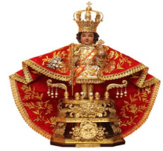
National Shrine of

"Creating A Community Of Involvement And Evangelization"