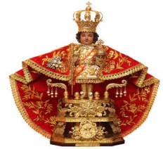
National Shrine of

"Creating A Community Of Involvement And Evangelization"